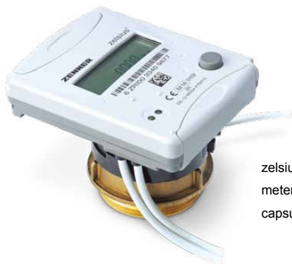
zelsius® C5-CMF Compact meter with coaxial measuring capsule (CMF)