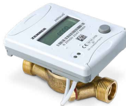
zelsius® C5-ISF Compact meter with single-jet flow sensor